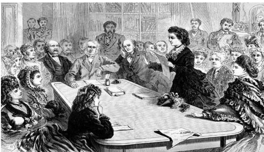
American woman suffrage advocates speak before the U.S. House Judiciary Committee in 1871.

The movement marks its beginning as July 13, 1848. This movement didn't just happen because someone thought that it was time for women to have the same rights as men, women of all ages came together at the start of it in order to fight for equality among the sexes. Women have affected changes in laws and human nature by holding meetings, petition drives, lobbying, public speaking, and also by demonstrating nonviolent resistance. Leaders of the movement fought for freedom in family life, government, religion, employment, and education. Over the years, they have successfully gained access to these freedoms and luxuries because a group of women never gave up and fought for the things that they believed in.